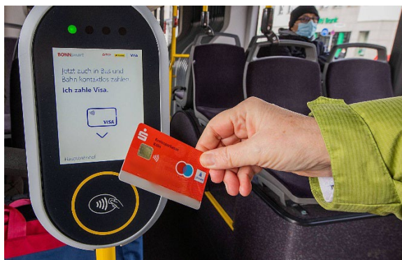
BONN Smart validation machine present inside buses and trams (except line 16 & 18)

Please note that you cannot use contactless payment for Trains (Regional and long distance)