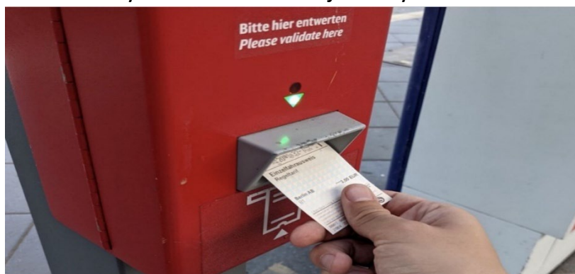
Ticket stamping machines can be present inside trams, or also outside in the station

If the ticket is purchased from the ticket machine outside of the tram, it must be stamped to get validated. Stamping machines are also present inside trams. Alternatively, if you buy the ticket from the ticket machine inside the tram or online, it is automatically validated for the journey.